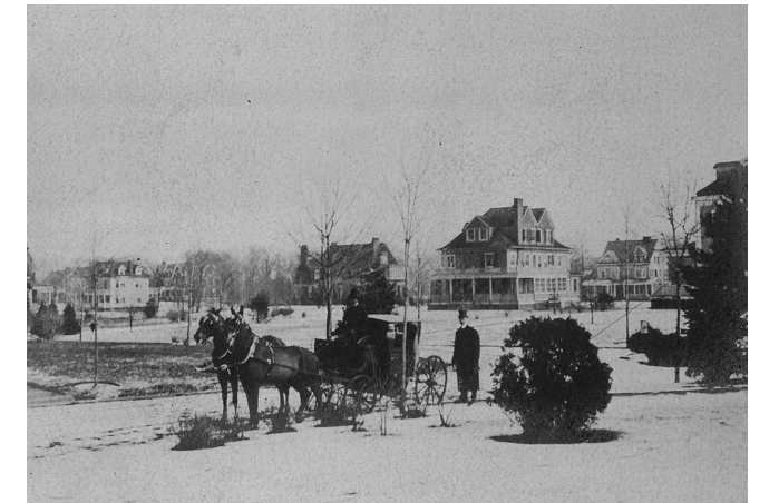
Erwin Park, 1901, at the beginning of its transformation into suburban housing.

Make a left on to Midland Avenue, then quick right on to Erwin Park. Follow the map through this neighborhood. When you reach Central Avenue, which merges into Valley Road, turn right.