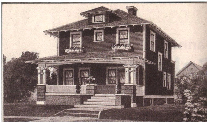
MODERN HOME No. 264B179

The American Foursquare is just that, 4 square rooms in plan, more or less. They are 2.5 story dwellings, characterized by a boxy, square exterior, usually capped with a 'hipped' roof sloping down toward each of the four façades (think pyramid). Large, projecting dormer windows break up the primary façade roofline, if not all four sides, allowing light into the third floor attic space. The larger examples typically have a central entrance hall and staircase with the four rooms radiating out from the